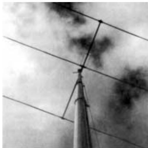
WINCH OPERATED TELESCOPIC MAST