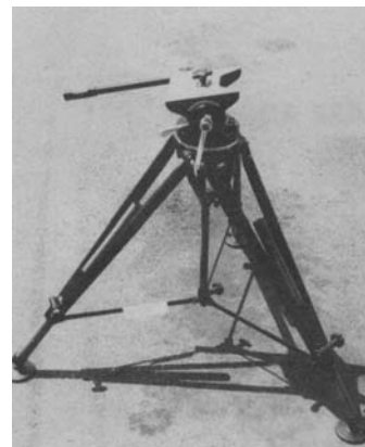
TP-9 with Pan/Tilt