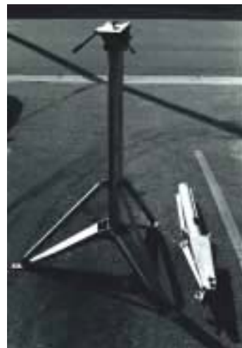
TP-8 with Pan/Tilt